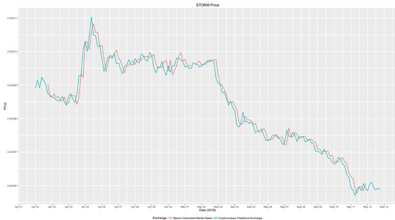
Figure: Price Of STORM on Bancor & Cryptocompare