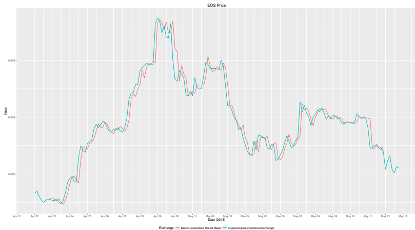
Figure: Price Of EOS on Bancor & Cryptocompare